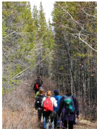
Junior High Students Hiking at Ribbon Creek

Program delivery this past year was extremely successful. We exceeded our target numbers, presenting 153 programs (296 visits) to 3836 students and their teachers in 57 schools in Calgary and surrounding areas.