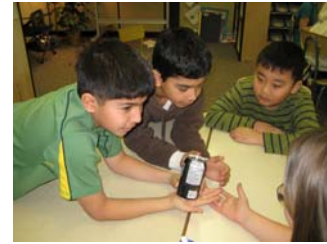
Students working on the 'Marsh Metaphors' activity during the Water Rangers Program

On March 19, 2009 Suncor hosted a media launch to announce their Community Investment Partnerships. The successful event housed more than 60 guests, had great media coverage and gave lots of exposure to Alberta ECO-Trust, the Centre for Affordable Water and Sanitation Technology (CAWST) and CPAWS.