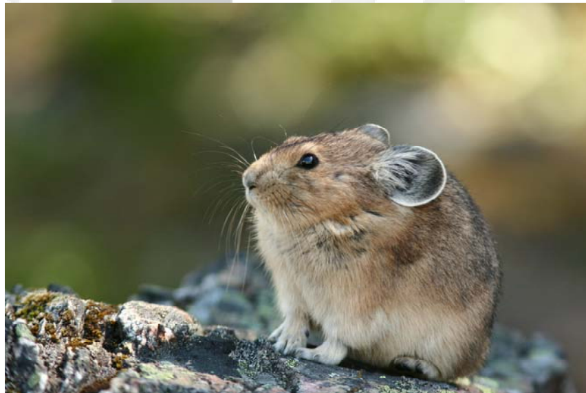
Pika, Moraine Lake

- The Staff and Board of CPAWS-Calgary/Banff